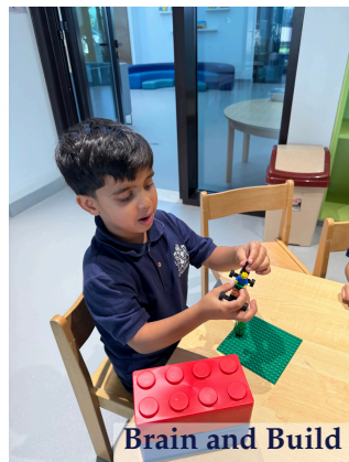
Brain and Build